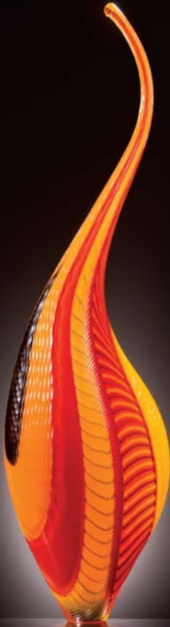
26.75 x 7.5 x 5"