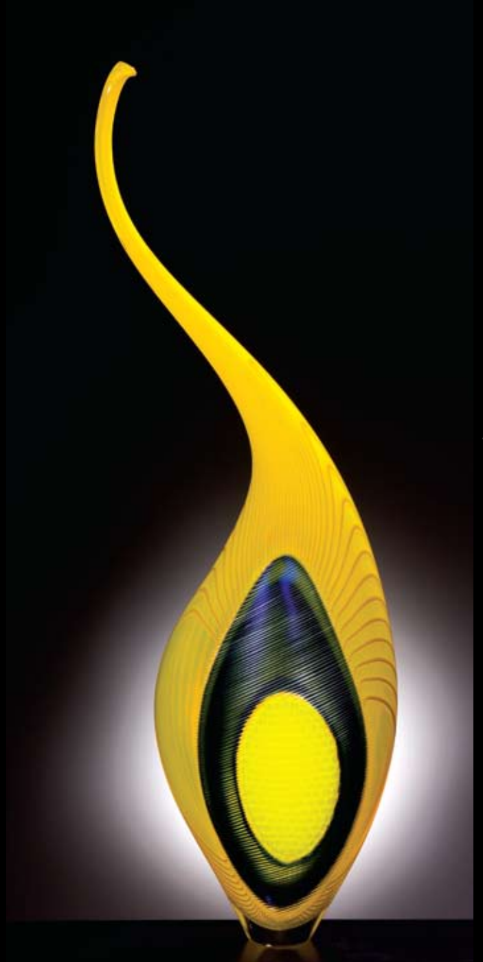
27 x 9.25 x 5"