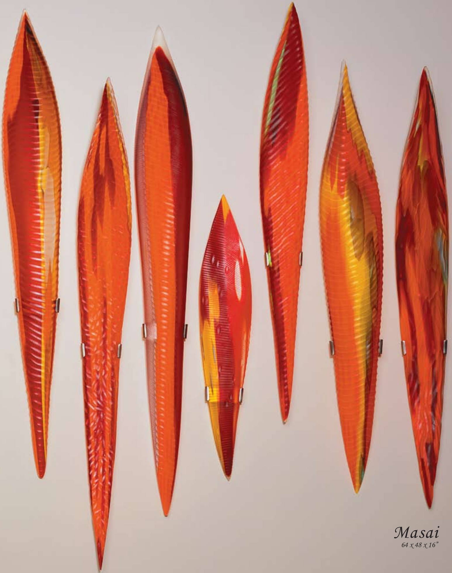
Masai 64 x 48 x 16"