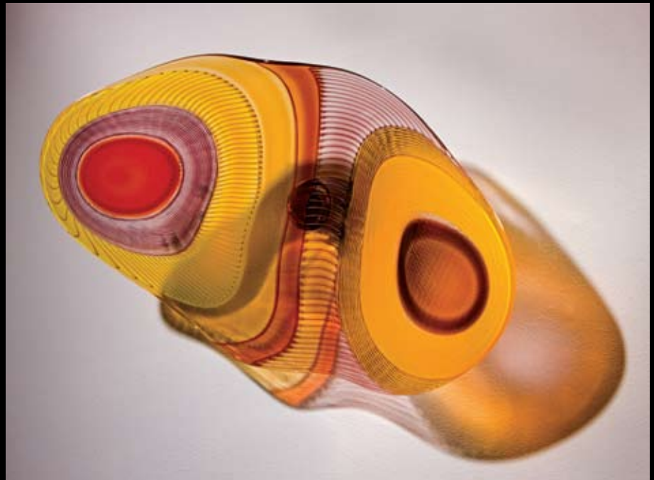
20 x 27 x 11"