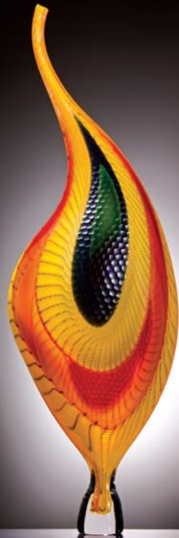
21.75 x 7.25 x 5.25"