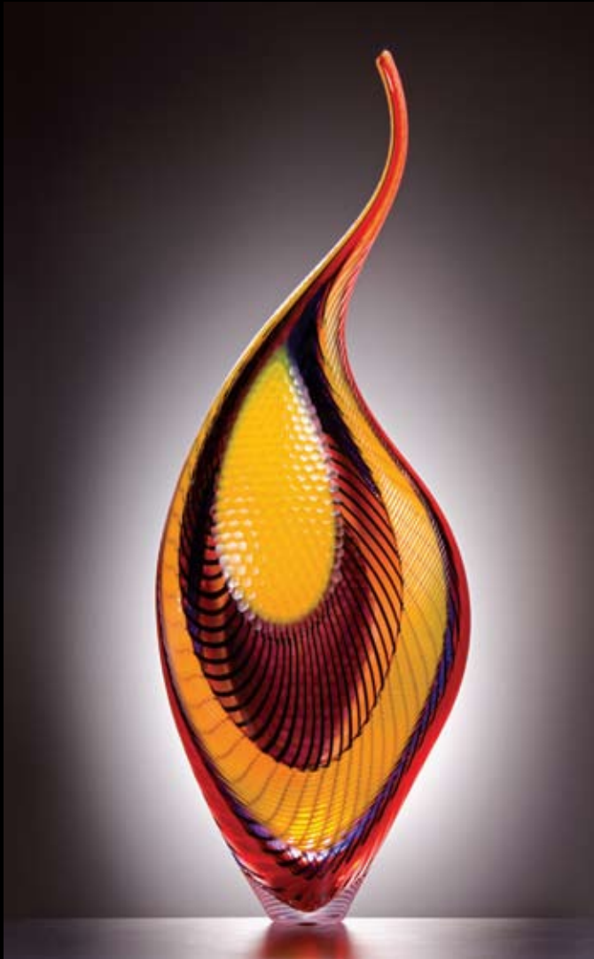
19.5 x 7.25 x 5"