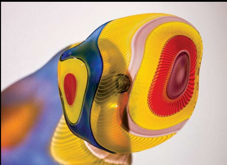
26 x 28 x 12"